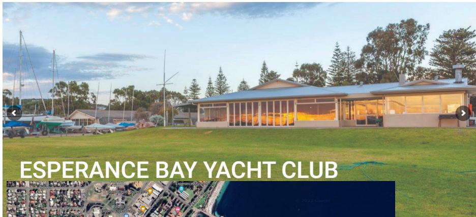
ESPERANCE BAY YACHT CLUB